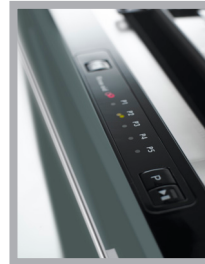
All controls located on top of door including digital display

Easy adjustable top basket even when fully laden