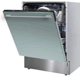
OPEN door view